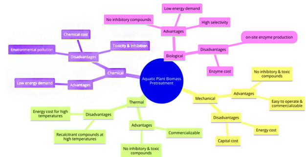
Figure 3. Pretreatment methods advantages and disadvantages of different pretreatment methods (Kendir & Ugurlu, 2018)

Research into the use of ultrasound to improve methane yield and solubilize microalgae biomass has revealed a variety of results ranging from negative to positive effects. These studies, which focus on the physical aspect of pretreatment, demonstrate that ultrasound is not the only method for preparing microalgae cells for subsequent use. This variety of results emphasizes the complexity of