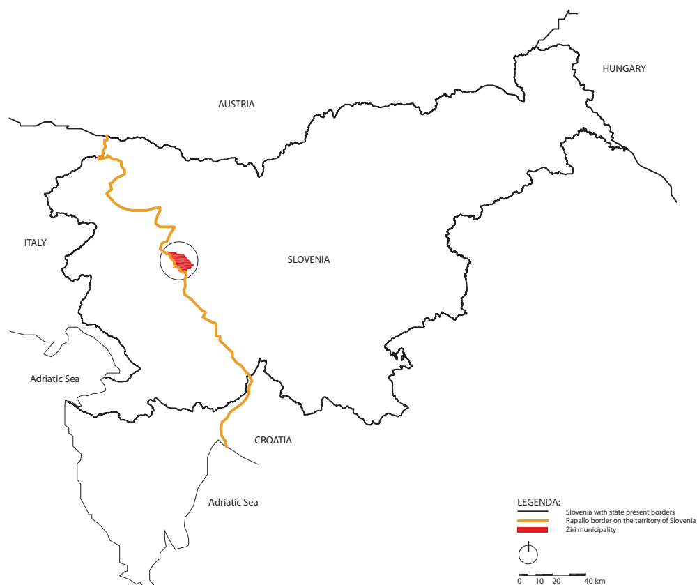
Figure 1. Rapallo border in Slovenian territory

The entire stretch of the Rapallo Border, with the Alpine Wall on the one side and the Rupnik Line on the other, was thus authoritatively and uncritically sited. It divided the territory and cultures, it cut into the natural and social fibre, tore apart social lives and the existing built tissue, following the goal mentioned. As such it never fulfilled its supposed function and was never entirely