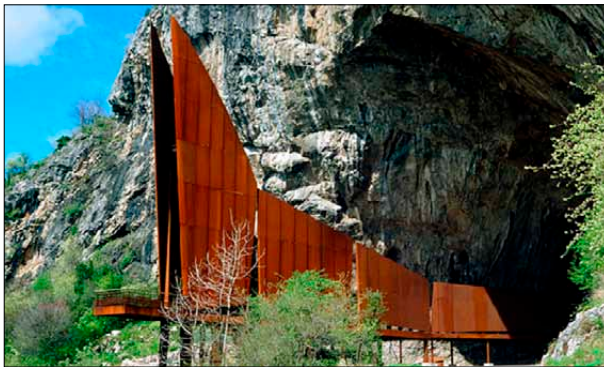
Fig. 7. The Cave Painting Museum in Niaux, France, entrance

Resembling a giant sculpture or piece of earth art with a rusty metal surface take us on a journey into dark cave of the prehistoric past. As if a millions of years ago, a thin multi legged creature slither out of the stone cave for fresh air and overlook the splendor of Pyrenees valley and mountains. The obvious metaphor of something very primitive, antediluvian, extinct ten thousand years ago reinforces emotions in both directions impressive view looking to the breathtaking valley or moving in the direction of mystical cave,