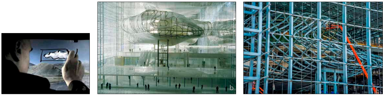
Fig. 9. “La Nuvola” Congress Palace in Rome

ism time. The powerful size of the plain rectangular glass box holds inside of it the freely accommodated, constantly changing form of the “Nuvola”, which contains main auditorium. The volume of main auditorium hanging in the air will be covered by a semi – transparent high – tech fabric which filters and provides natural and artificial light during the day and night in and out and vice versa. The strange amorphous “cloud” will be further dematerialized and with its constant alteration, creates unique, intriguing artistic effects. This “cloud” could be seen as a sculpture, a performance of sorts but in the end it is a piece of architecture that contains a strong and unmistakable metaphor. The Congress complex filled with an ephemeral intelligence, filled with ideas, discussions and a whirlwind of thought can, as a cloud may, suddenly turn into a natural disaster, a threatening tornado or it can be a cloud without rain or power, floating calmly without seeming purpose and then disappearing without a trace. The mystifying power and peace of thought.