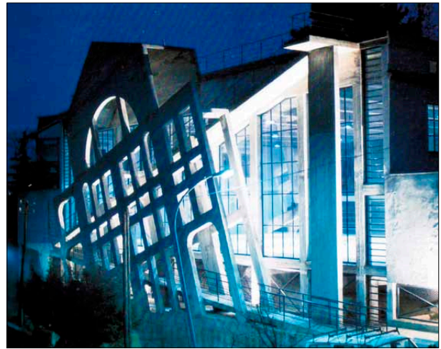
Fig. 4. Gym in Paliano, Frosinone

Fuksas' architecture is not about examining architectural problems, for him it is infinitely more important to examine what comes after it, or what was "before" it. In this process, he avoids formality and breaks out of banal and conventional aesthetic limits. Fuksas' creative credo was very laconic spoken by words "Less Aesthetics, More Ethics" (Fuksas 2005: 170) at Architecture Biennial in Venice 2000, when he was appointed as a director. On the gigantic video screen – a wall of 280 meters long and 5 meters high, a nonstop direct translation of images from eleven world's biggest megacities were displayed which demonstrated the power of the virtual world and conscious metamorphic touch with reality, emotions and politics. The global phenomenon of megapolis, the role of architecture in the changing process of it, and the role of new media communication were the themes of the Biennial. Nominated two conceptually related ideas; as architect's connection with the media – the public service advertising, and use of a virtual images in the design process. Fuksas had no intentions of forging the way for the future or to create slogans of the era, however, he unlocked the door and left the questions open for reflections and discussions.