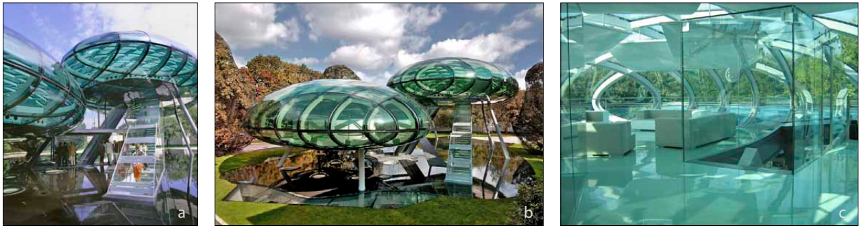
Fig. 5. Nardini Research Center and Auditorium, Bassano Del Grappa, Vicenza

with the client in a restaurant. This idea stuck and remained clear and untouched throughout the rest of the realization process.