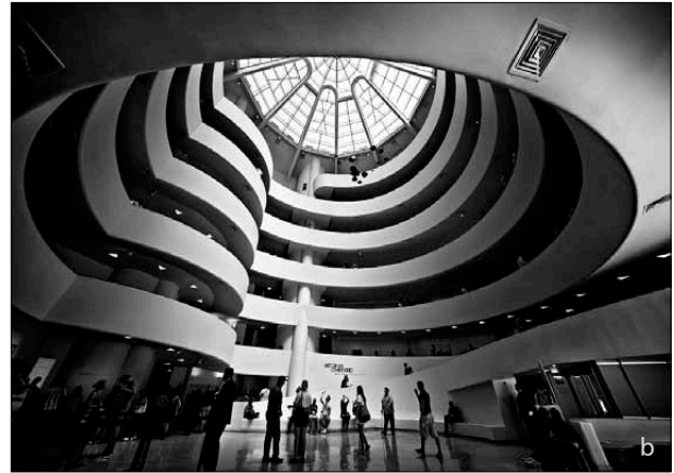
Fig. 2. Guggenheim Museum, New York

a stepped or winding pyramidal temple of Babylonian origin” (Druett), was outstanding and extremely strange in the rigid and pale background of Fifth Avenue. Prior to the opening of the museum twenty-one artists signed a letter protesting the display of their work in such a space. Today the Guggenheim Museum became not only symbol of New York City, but also a symbol of modern art as we know it. Society responded in a similar way to a bold and brave creator’s idea in Paris 60 years back in 1889. Through strife, misery and ultimately his own personal investments engineer Gustave Eiffel’s metal tower was build. Eventually the tower became one of the most famous and romantic symbols of the city and urbanism in all world.