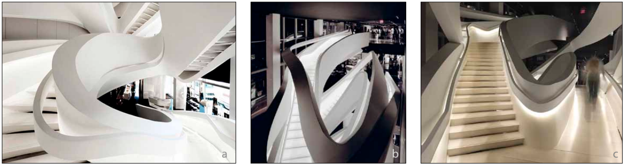
Fig. 6. Armani Store New York, 5th. Avenue

gentle, sensitive but also a direct connection with the world – the famous Museum and not any less famous Chrysler building linguistic and this encoded sign confirms in our subconscious, that what we see belongs to New York. It is bold and new, but at the same time it continues with the best of New York City's traditions. Once again, with the backdrop of dynamic and hipper expressive form it is concealed metaphor and symbol that speaks to us and appeals to our individual imagination, which like echo returns to prove, that what we see, is not a form, or shape or material, more important is what we feel and what lies behind all of it, the architect has created something new using best metaphor of modern New York City.