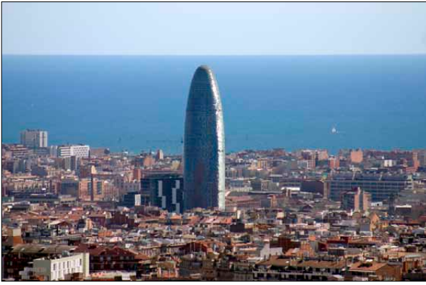
Fig. 3. Agbar Tower, Barcelona

A Symbol of the city may also be the most significant public building in the town such as a religious center, museum, concert hall, library, government palace, or airport.