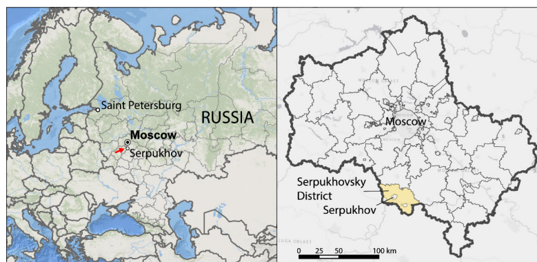
Figure 1. Location of the study area

We used Gauss Krueger’s projection – transverse cylindrical equilateral map projection. This projection is